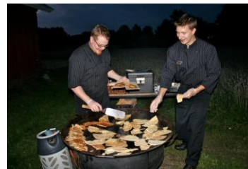
Finnish chefs prepare a traditional dessert for our last dinner – thin pancakes with whipped cream and lingonberries

Our appetites for more study on new opportunity best practices. We have to examine how to better develop not only the traditional co-operative sectors but also new sectors including how to deliver more public services in a co-operative way. In Canada we already deliver health care through co-op clinics, as well as homecare and ambulance services in Quebec.